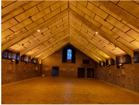
The nave facing towards the entrance area with small gallery above.