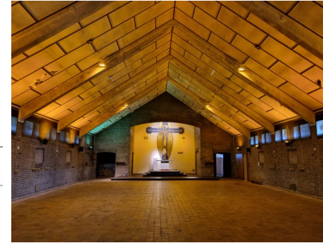
The nave facing towards the sanctuary.